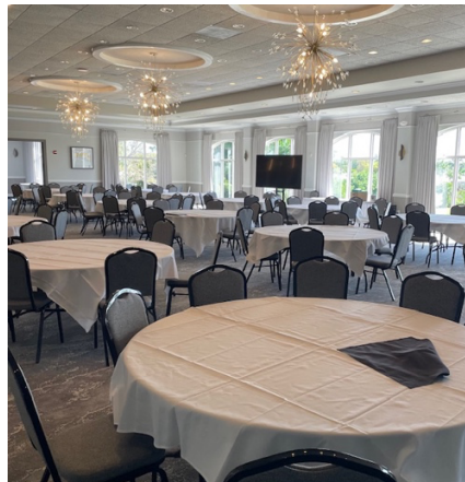
Spanish Wells Dining Room