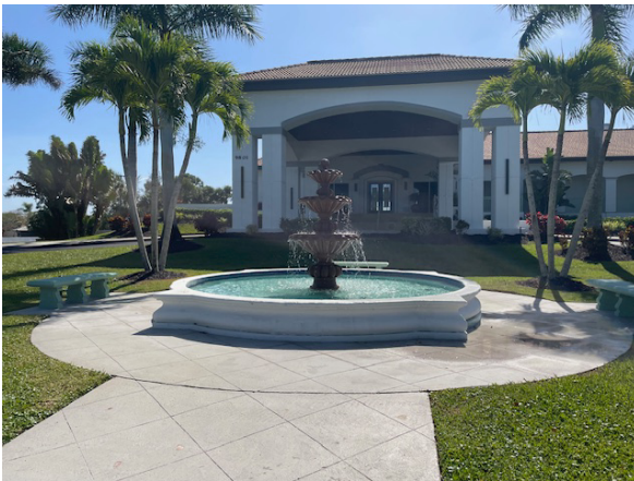
Spanish Wells Front Entrance

TOMORROW: Be sure to attend tomorrow's meeting at Spanish Wells Golf & Country Club , 9801 Treasure Cay Lane, Bonita Springs. Arrive no earlier than 6:45 a.m. for coffee. Breakfast will be served at 7:00 a.m. Parking available on the north, west and south sides of the entrance. Elevator access on the south end, near the entrance to the pro shop and the snack house.