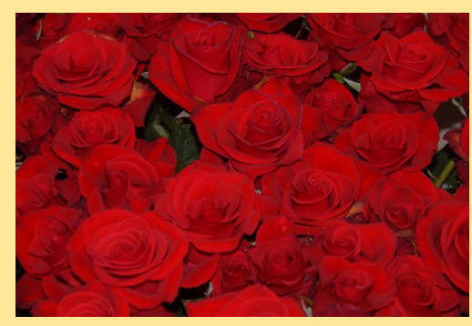
Rotary Sings: The Rose

Some say love, it is a river that drowns the tender reed.