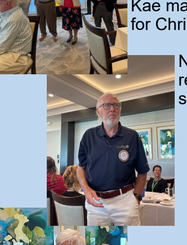
Guests were welcomed.

New Paul Harris Award recipients were presented their pins.