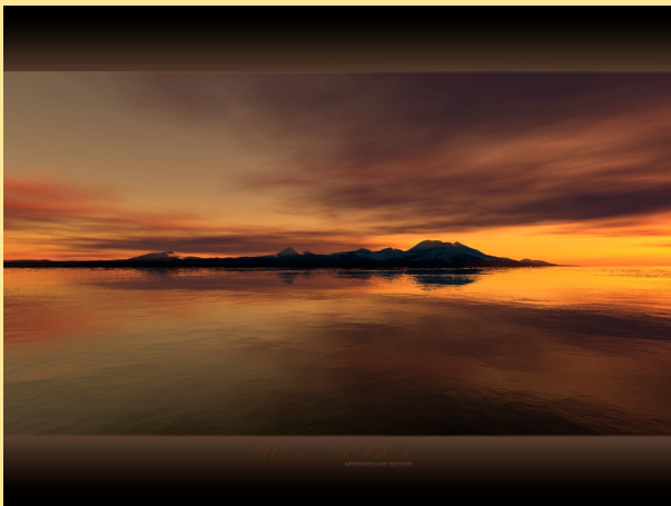
Morning Has Broken Cat Stevens

Morning has broken like the first morning. Blackbird has spoken like the first bird. Praise for the singing. Praise for the morning Praise for them springing fresh for the world.