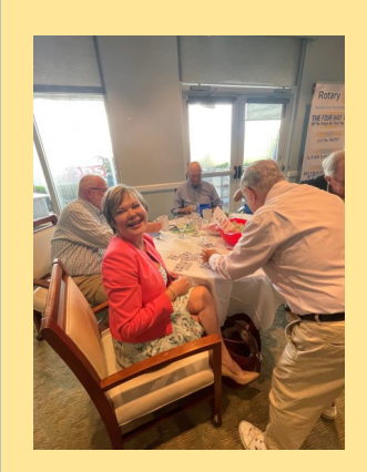
50/50 Nope! $1,402 1 Ace left

Let it be, let it be, let it be. There will be an answer. "Let it be." Let it be, let it be, let it be, let it be. Whisper words of wisdom, "Let it be."