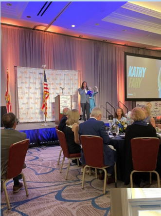
Rotary District 6960 Conference at The Hyatt Coconut Point.