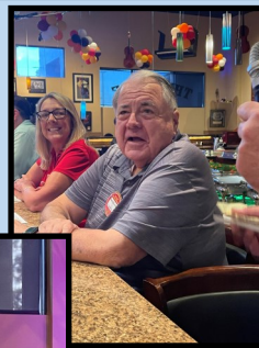
and Halloween mayhem!