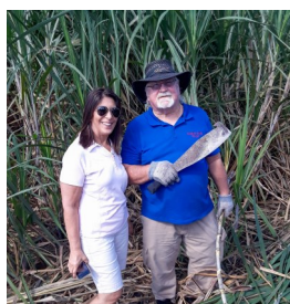
Tour to US Sugar