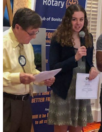
Estero High Students