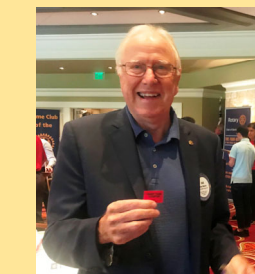
50/50 We have another $100 winner!