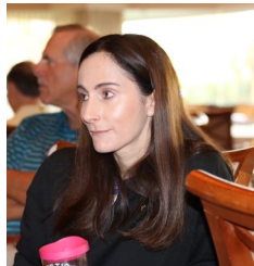
Can't pic- ture Mary using bad language!