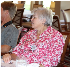
Welcoming Rotary Regulars!