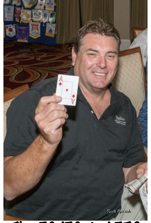
The 50/50 is $578