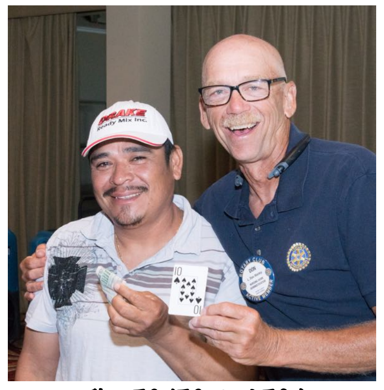
The 50/50 is $564