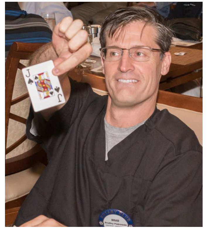
The 50/50 is $500