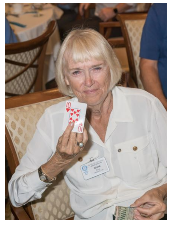
The 50/50 is $1,570 Birthdays

Roger Brunswick Feb 26 Carl Schwing Feb 26 Jim Renfro Mar 2