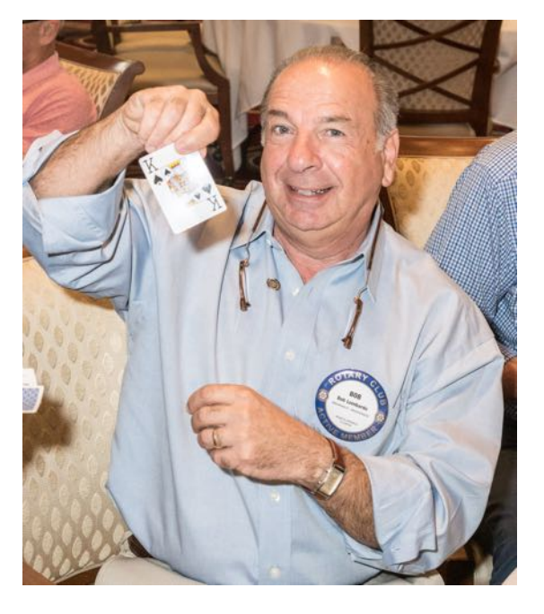
The 50/50 is $965 Birthdays