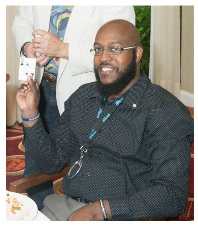
The 50/50 is $701