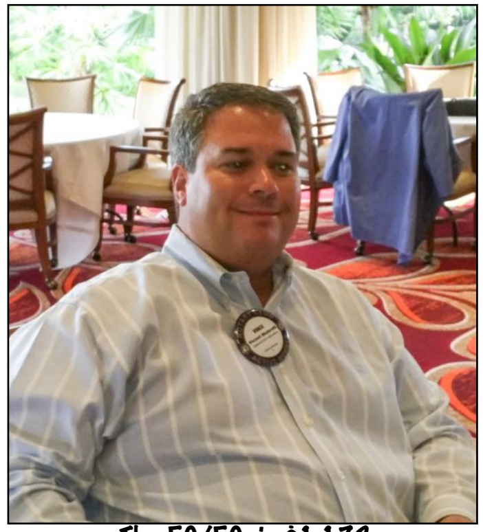
The 50/50 is $1,173