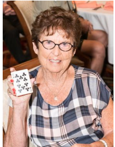
The 50/50 is $748

The 4-Way Test of things we think, say or do.