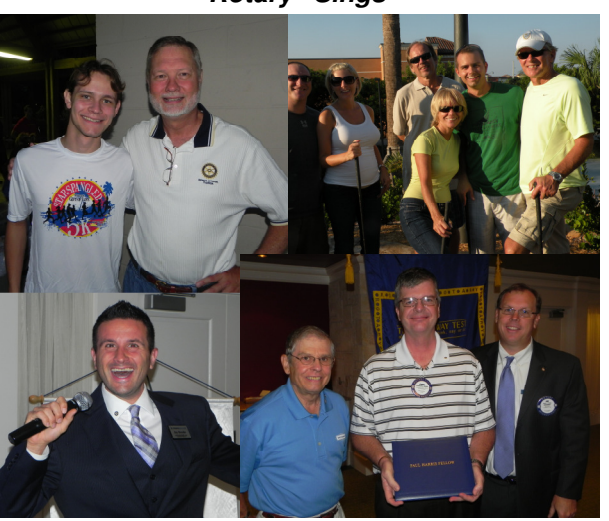
The Whole World in His Hands

He's got the whole world in His hands. He's got the whole wide world in His hands He's got the whole in His hands He's got the whole world in His hands