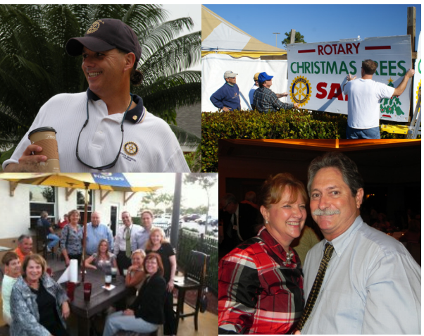
This Land Is Your Land

This land is your land, This land is my land From California to the New York Island, From the Redwood Forest To the Gulf Stream waters; This land was made for you and me.