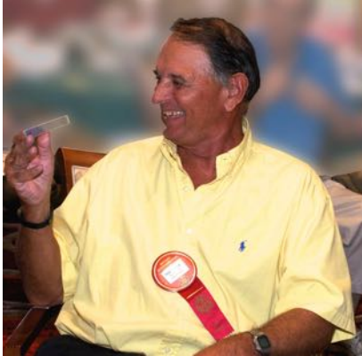
The 50/50 Now $2,368

The 4-Way Test of things we think, say or do.