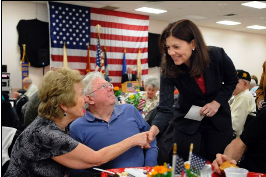
U.S. Sen. Kelly Ayotte, R-N.H., told the veterans she was happy to be invited back this year. "I am humbled to be in the presence of so many that served our country with distinction."