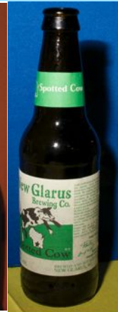
Beer of the Year