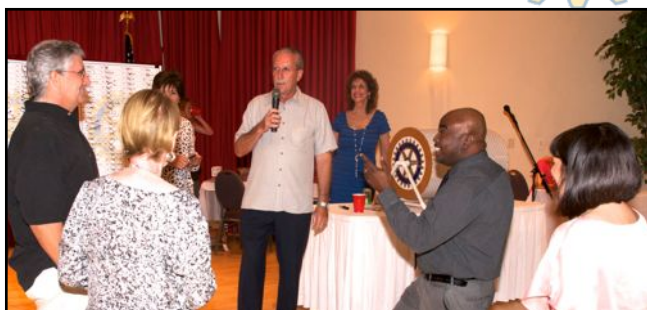
George moderates as member and representatives of The Final Five deliberate.

The 17th annual Reverse Raffle ended with a whimper as The Final Five, mostly proxies, decided to take $3,000 apiece and call it a night.