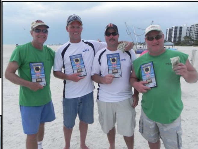
First and Second Place Winners