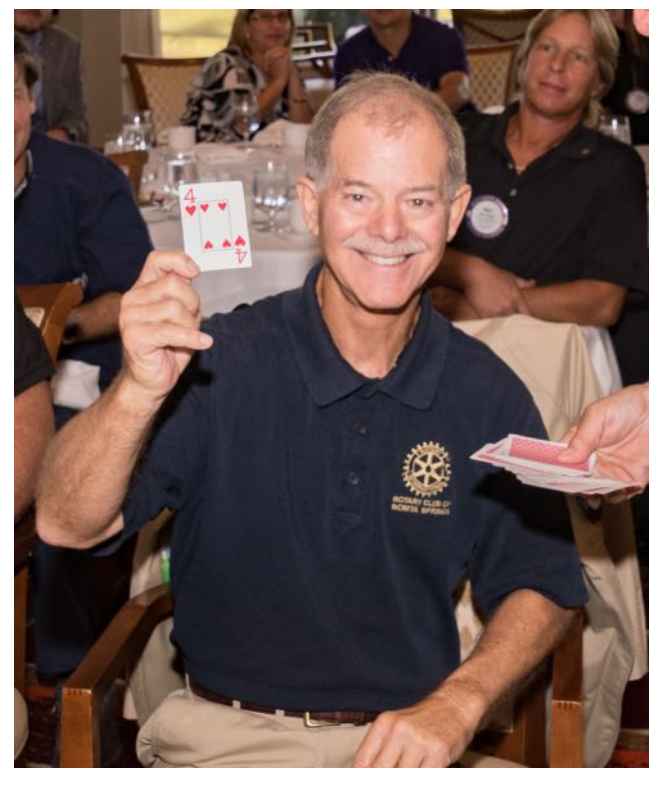
The 50/50 is $700±