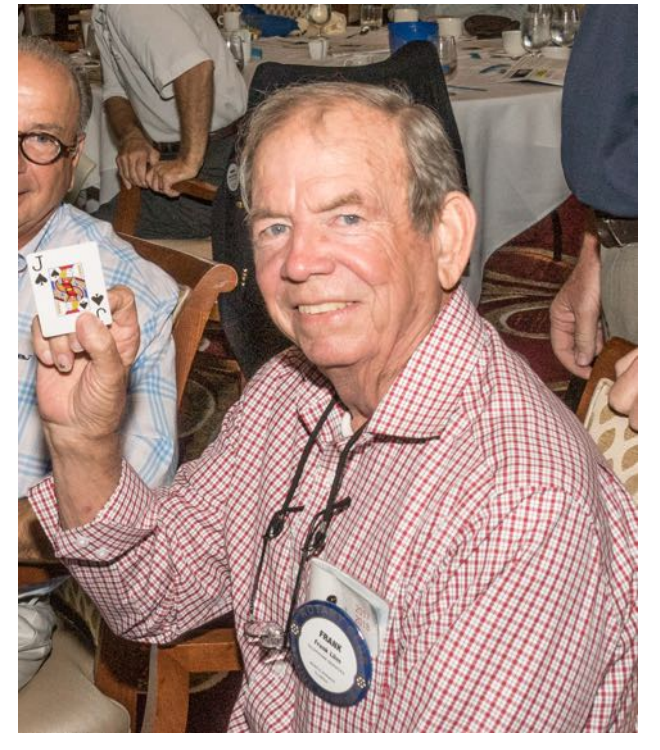
The 50/50 is $2,550 Birthdays