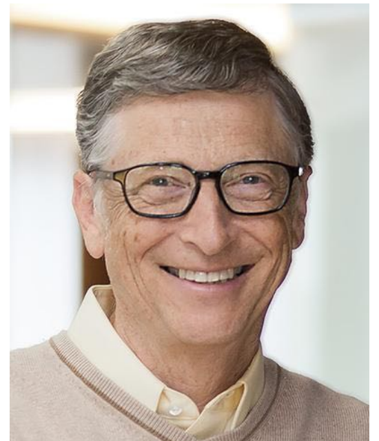
Bill Gates extends 2 to 1 match for three years.

The historic pledges of new funds at the Rotary Convention in Atlanta, Georgia, USA, will go toward drastically shrinking the $1.5 billion gap in the funding that the partners of the Global Polio Eradication Initiative say is needed to reduce polio cases to zero worldwide. Just five cases have been reported this year, the lowest number in history.