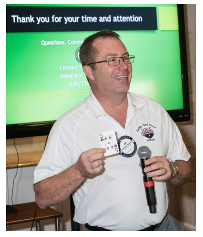
The 50/50 is $1,875± Birthdays