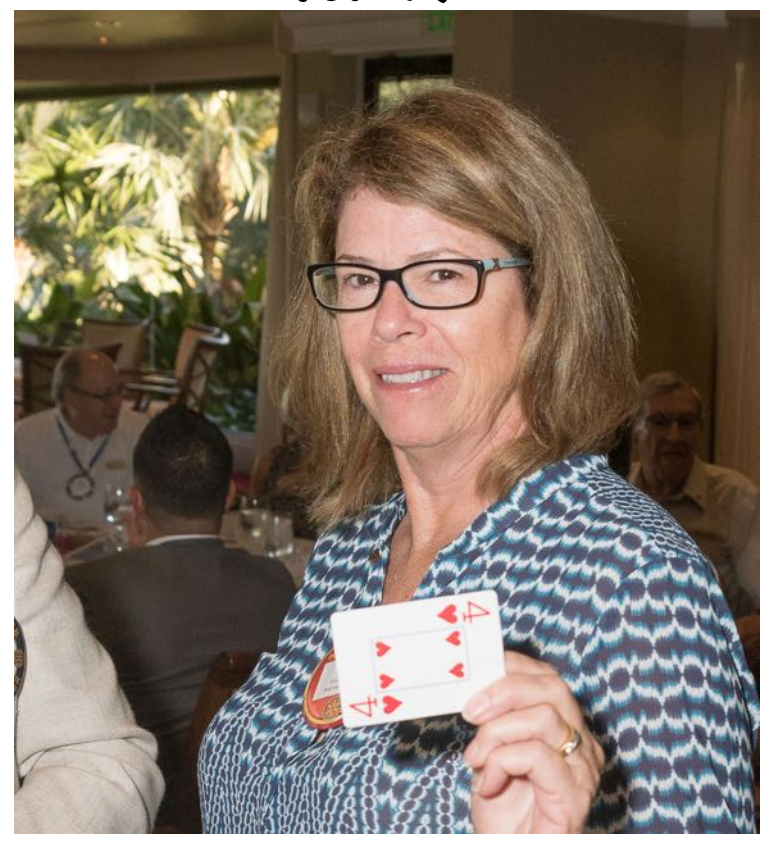
The 50/50 is $796