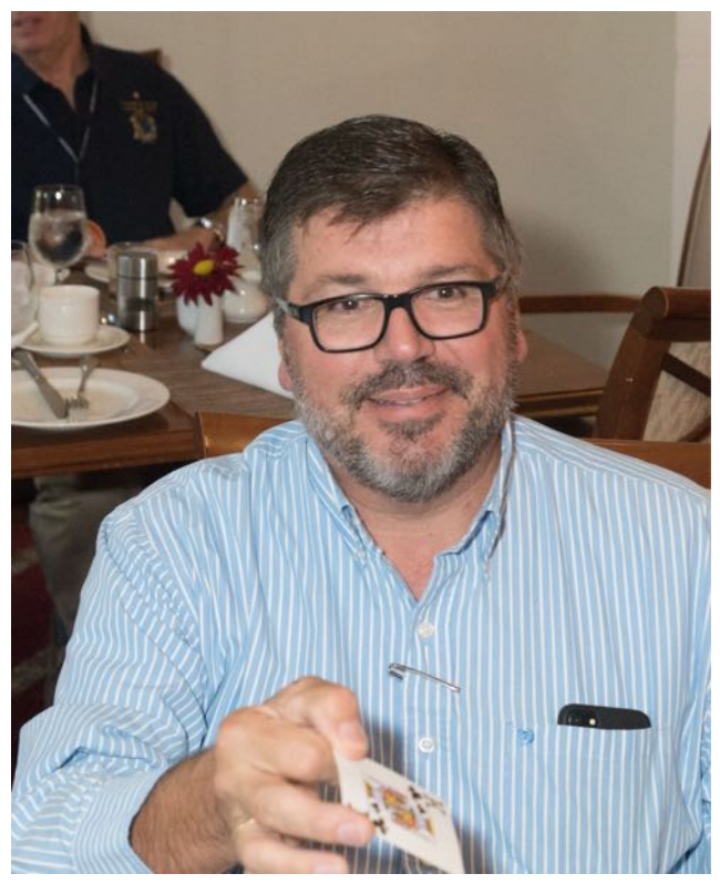
The 50/50 is $650±