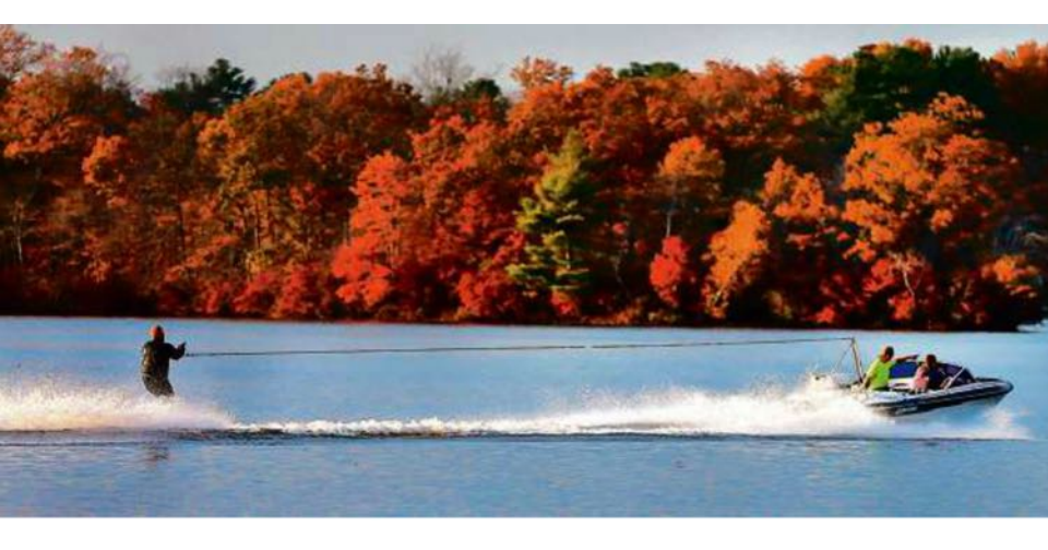
Fall foligage viewing Pembroke, Massachusetts

to better understand the characteristics of storms that produce overwash deposits.