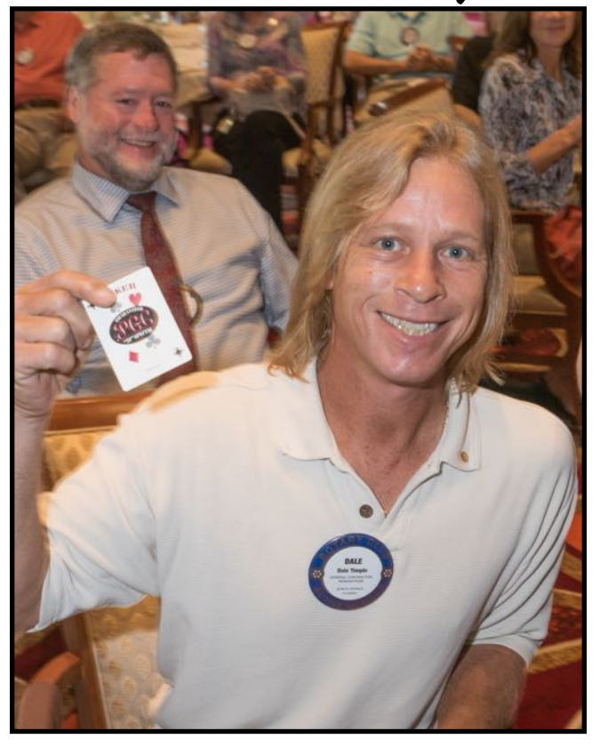
The 50/50 is $500