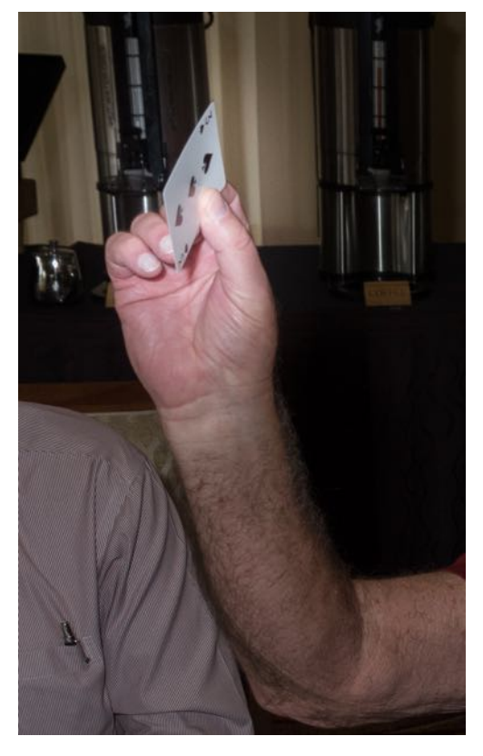
The 50/50 is $1,219