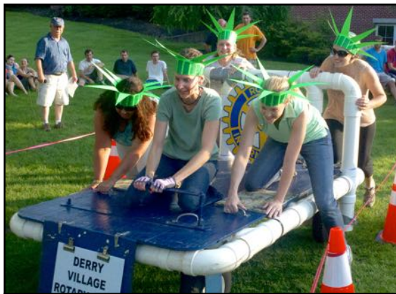
All-Girl bed race team Derry, NH