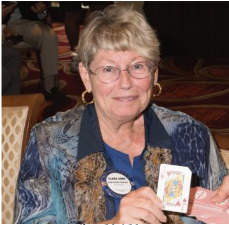
The 50/50 is: $510